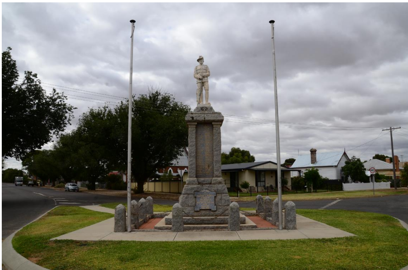
Inglewood & District War Memorial