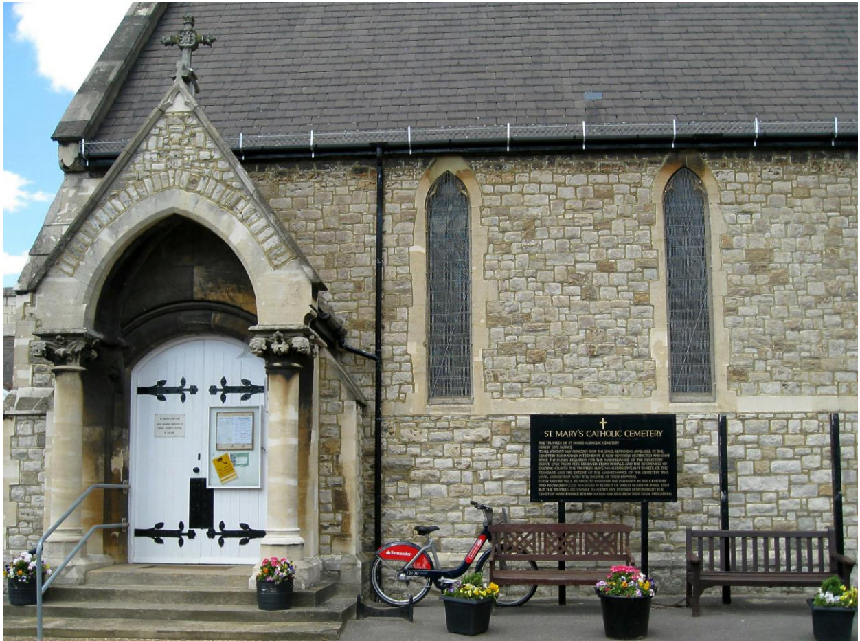
St. Mary's Roman Catholic Cemetery