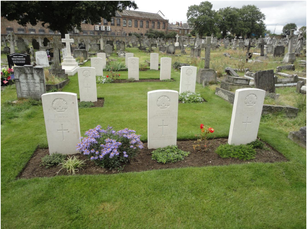
Australian Plot in St. Mary's Roman Catholic Cemetery, Kensal Green