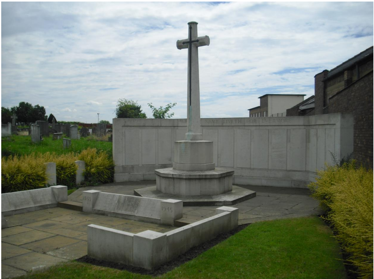
Cross of Sacrifice